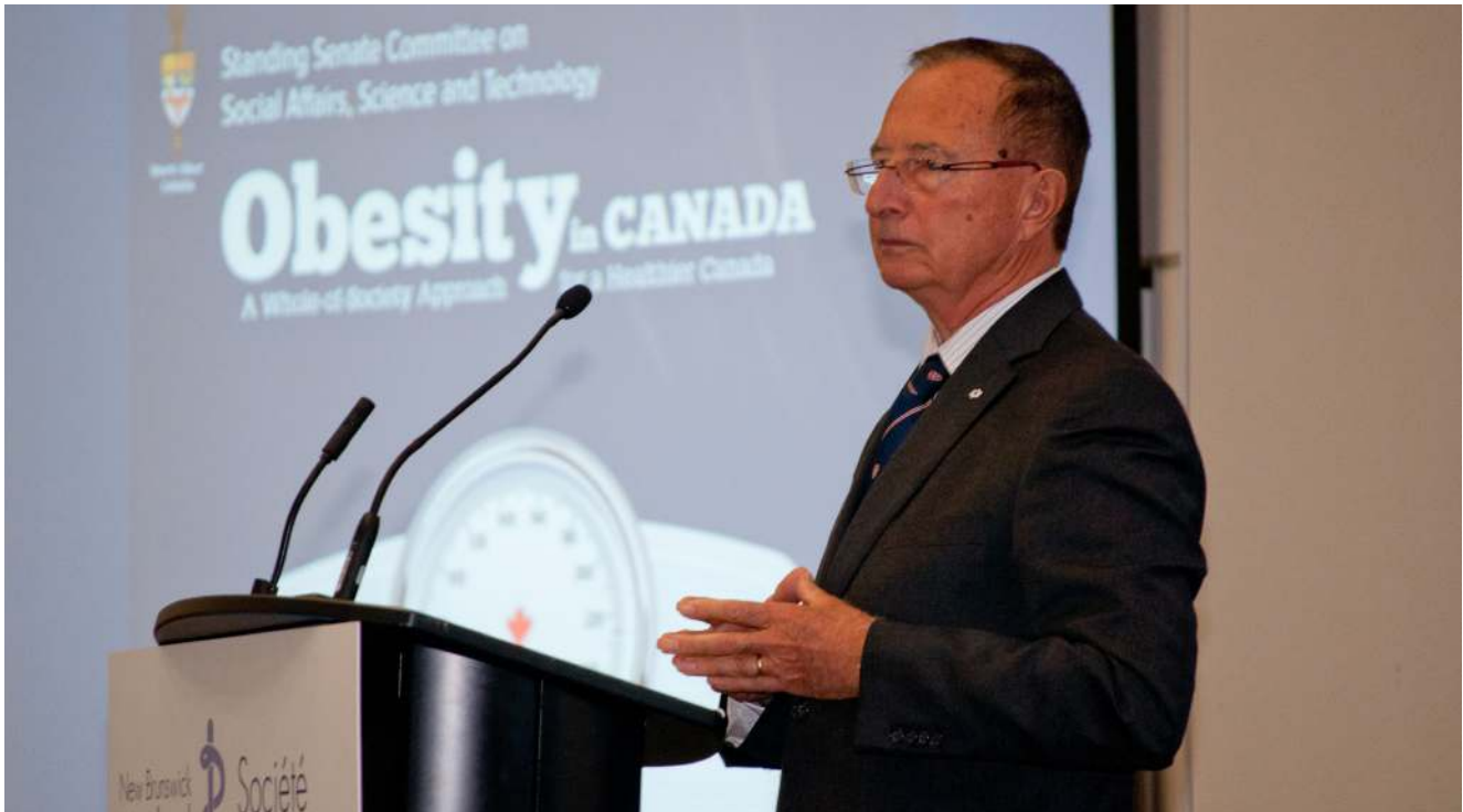
Senator Kelvin Ogilvie, Chair of the Standing Senate Committee on Social Affairs, Science and Technology, that authored the “Obesity in Canada” report in 2016.

The root causes of poverty must be addressed. A minimum wage that allows people to comfortably afford basic living requirements and increased affordable housing options located in central areas are changes that will allow people more opportunity to invest in their health.